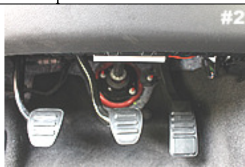
Shown is the LED lamp centered under driver side of dash.