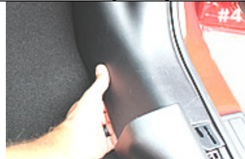
Remove kick panel shown. First pull upward, then backward gently.