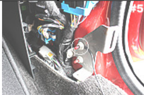
Attach black ground wire to the 10mm bolt circled above.