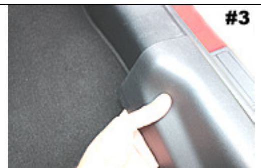
Loosen passenger side door sill plate – you may remove if desired.

In the following steps we will prep the surface and apply an adhesion promotor to ensure a strong bond. Once the c-channel (the black piece each lamp sits inside) is installed, it will be difficult to move so you want to be sure of the placement.