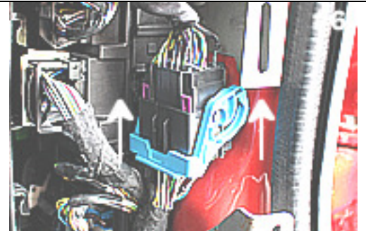
Lift blue bar upward to detach connector. It will 'click'.