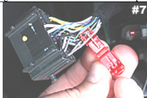
Slide Gray w/ Purple Tracer wire into place and close wire tap firmly.