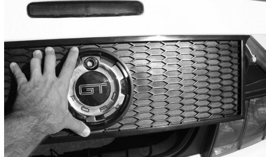
Fig. 2 – Place panel on car, using light hand pressure to check for proper fit BEFORE removing tape seal