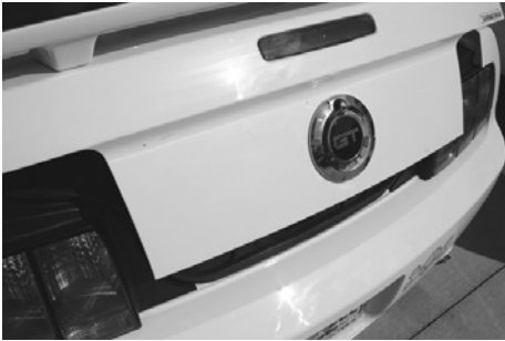
Fig. 1 – Hold Trunk Partially Open to aid installation